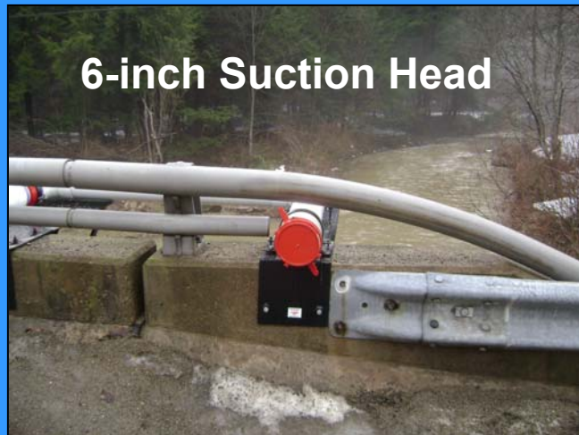
6-inch Suction Head

Low profile design with minimal intrusion into roadway. Hydrant suction head arm is lowered when needed and retrieved when not. Specialized waterway permits are generally not needed.