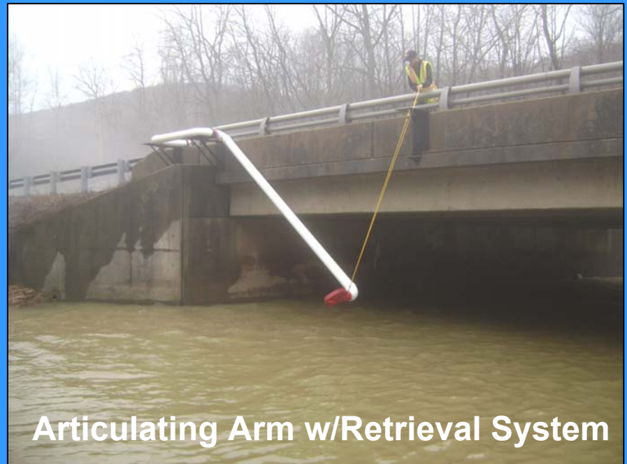
Articulating Arm w/Retrieval System

Low profile design with minimal intrusion into roadway. Hydrant suction head arm is lowered when needed and retrieved when not. Specialized waterway permits are generally not needed.