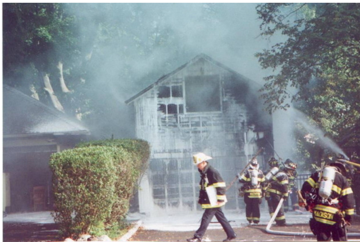
Class A foam used for exterior attack and overhaul.

Wetting agents are usually simple surfactants - they work to reduce the surface tension of the water to which they were added. However, wetting agents do not have the foaming qualities of Class A foam and thus lack the insulating and added heat absorption capabilities that foam offers. Most common wetting agents are proportioned at very low rates (0.3% or less) and are quite economical as a result. Suggested uses for these agents are brush and wildland firefighting, mop-up and overhaul etc.