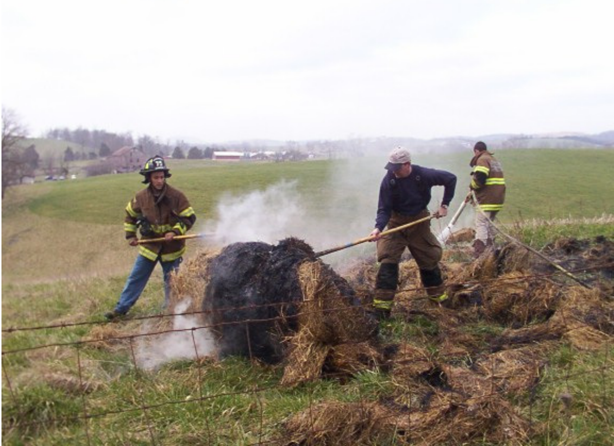
Class A foam used on a hay bale fire.