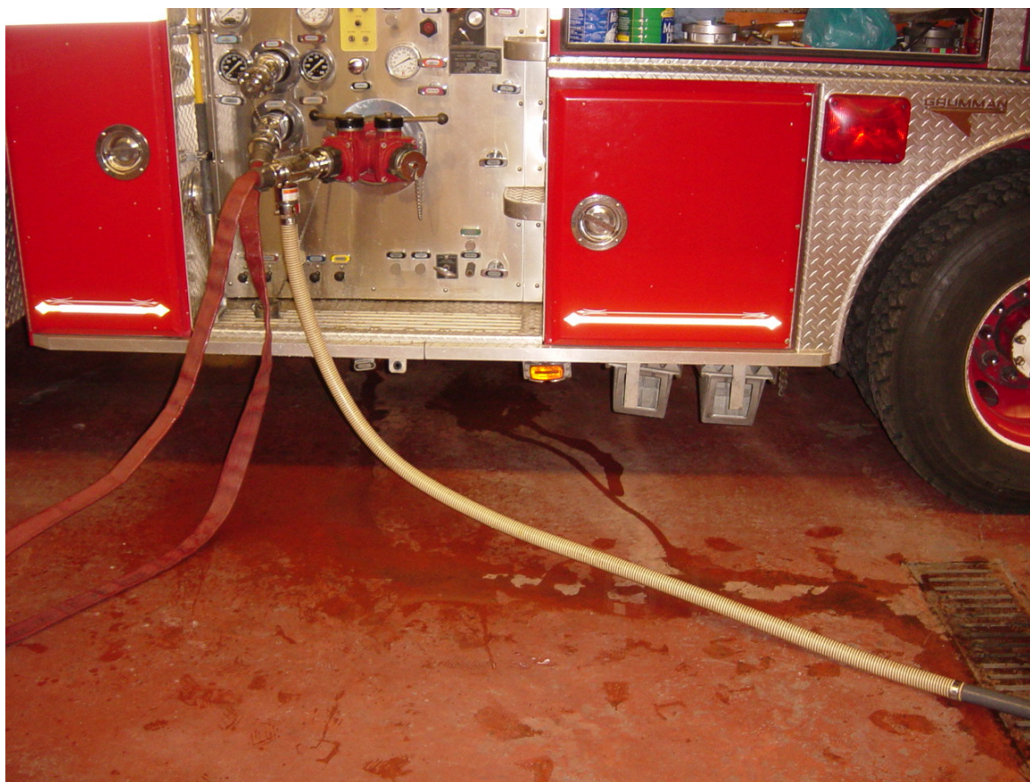
A FoaMidget set-up on a traditional pumper.