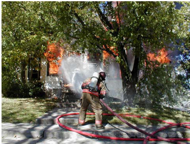
(Lawrenceville KS FD - Courtesy Cafsinfo.com)

Class A foam in the form of compressed air foam (CAFS) has helped some fire departments address those issues - it is not a cure-all but it does help.