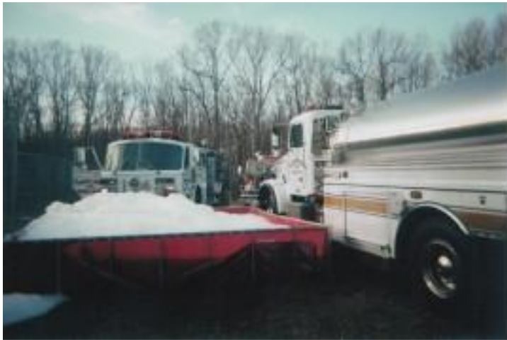
A Class A foam batch-mixing operation in Winfield, MD.

As with around the pump systems, batch mixing allows foam solution to run into every part of your pump - so thorough flushing of your pump is needed after each use.