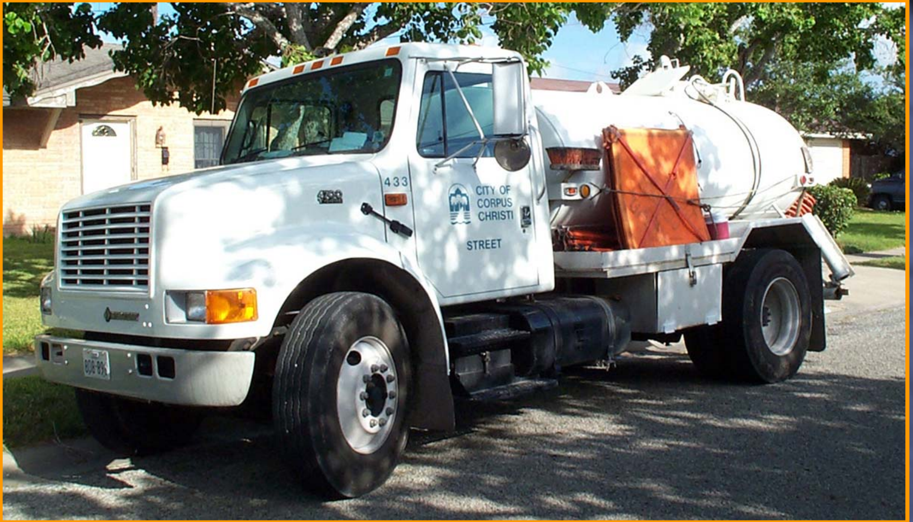
Figure 9A. Most municipalities have some type of water hauling vehicle in the public works or street departments. These can be equipped with large dump valves for use as auxiliary vehicles during an emergency.