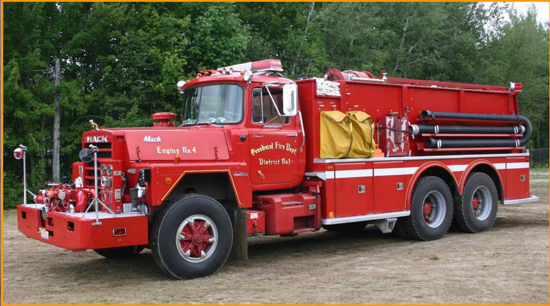
Figure 5. A pumper/tanker has a tank that can carry at least 1000 gallons and is equipped with dump valves. It's primary function is fire attack. Water transport is second.