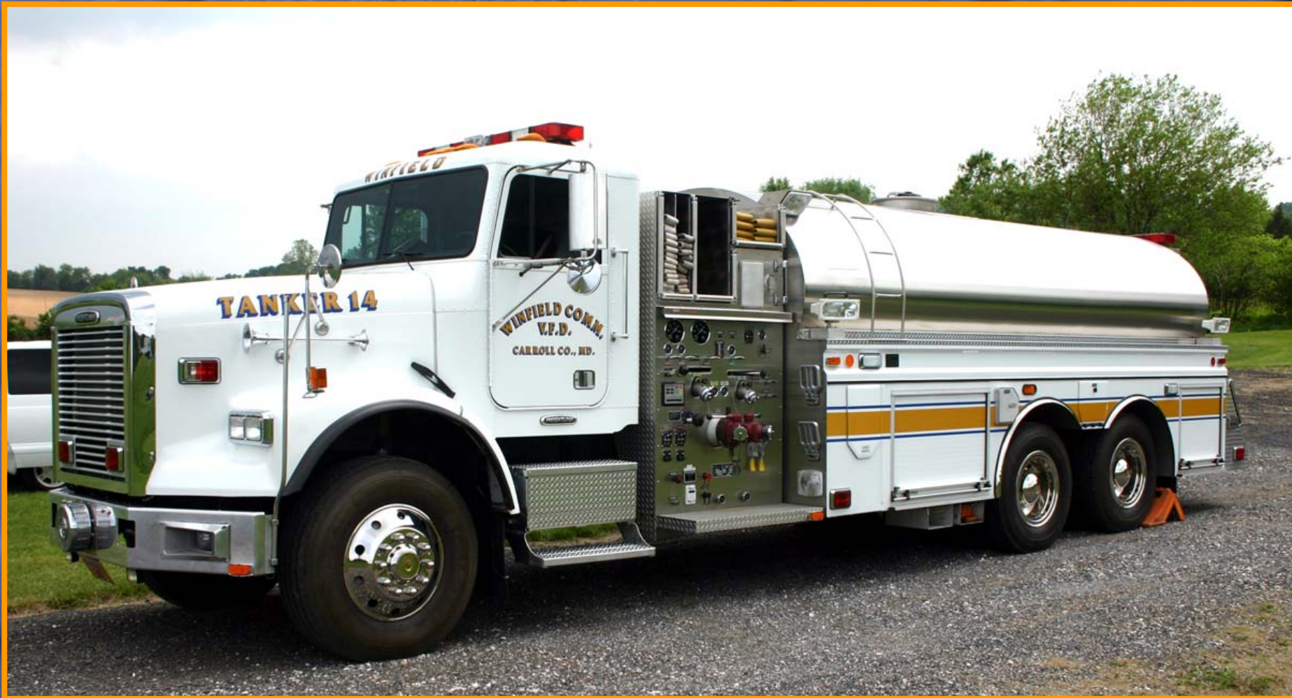
Figure 6. A tanker/pumper may or may not carry all the equipment required for pumpers by NFPA 1901. It's primary function is water transport. Fire attack is its secondary function.