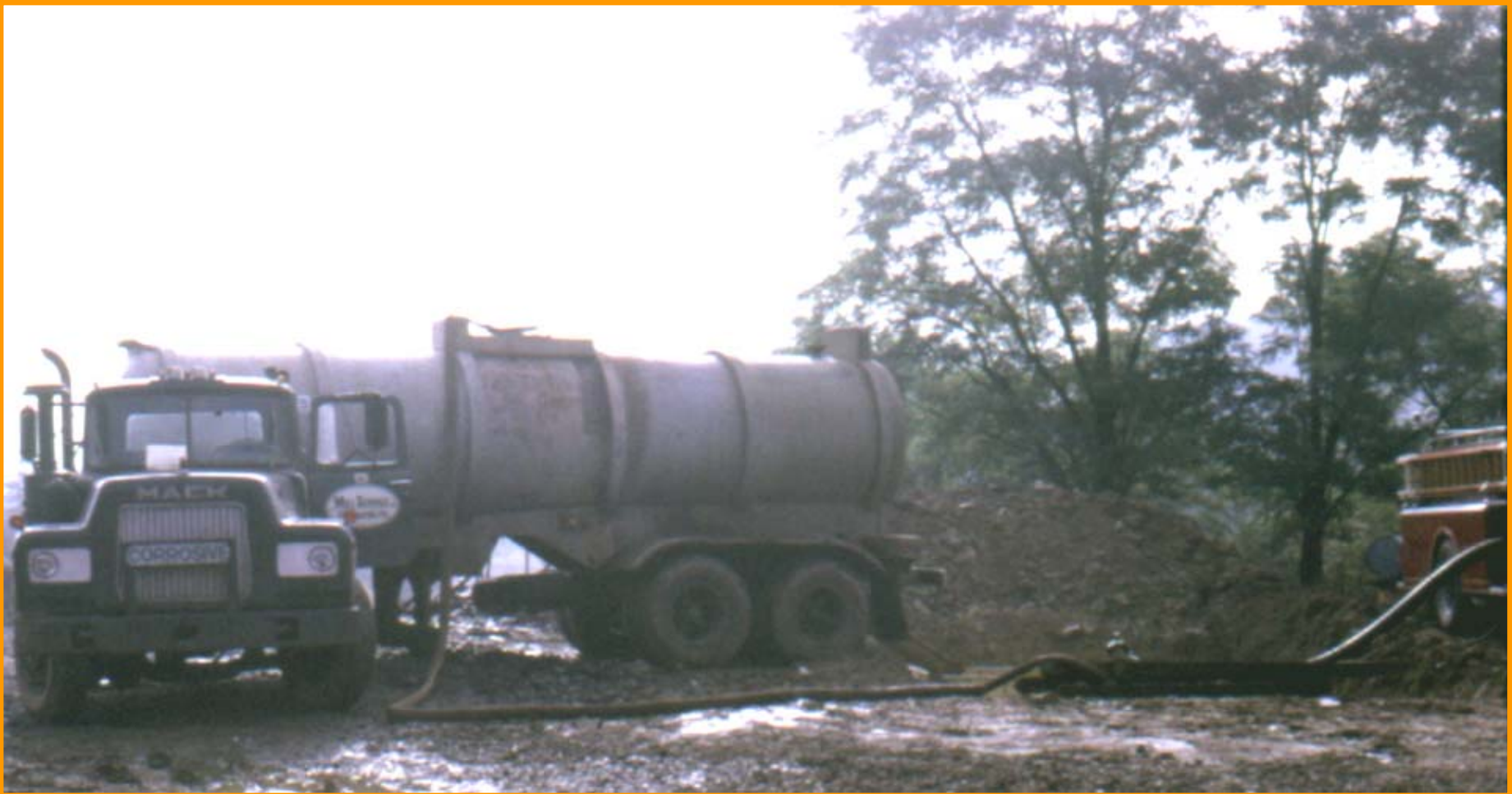
Figure 9C. This tanker's normal life is to haul acidic water from coal mines. In the evenings and on weekends and holidays, after these trailers have been flushed out, they sit empty. Here one is used to supply water to a live-fire training exercise in a rural area. Notice that a hole had to be dug for the porta-tank.