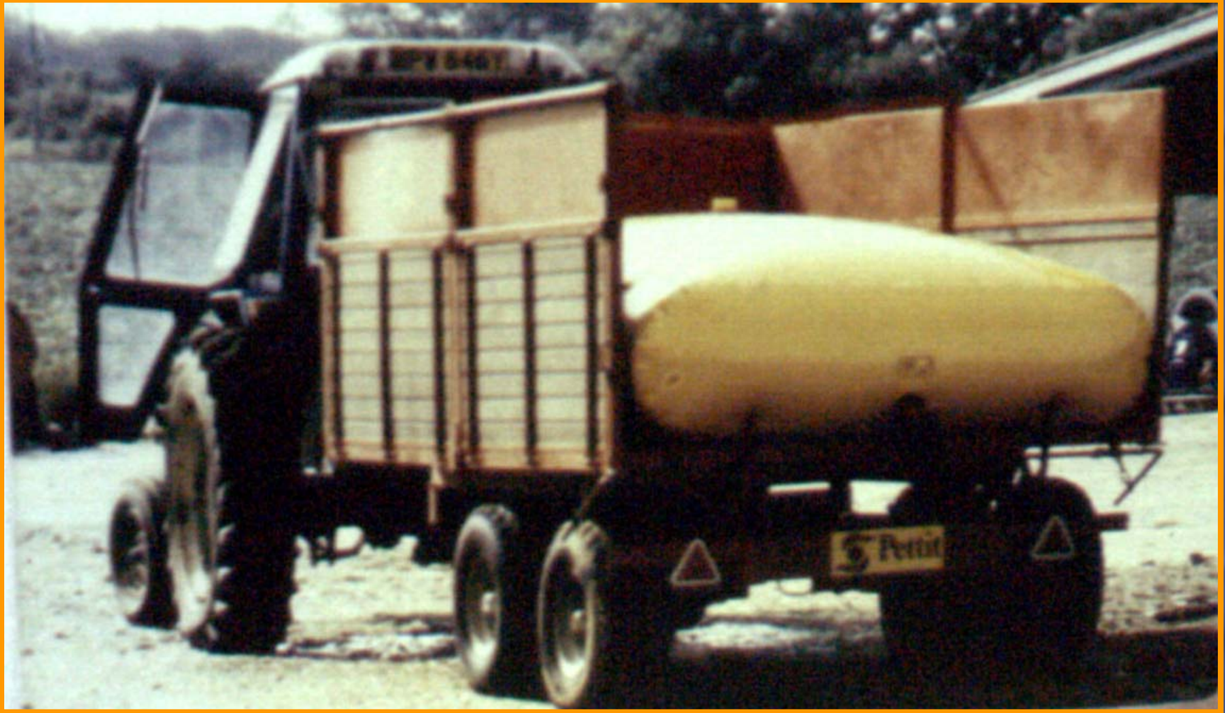
Figure 9B. Bladders such as these can be purchased in various sizes and can be hauled in about any type of vehicle. This one used by a farmer could provide extra water when needed in an emergency.