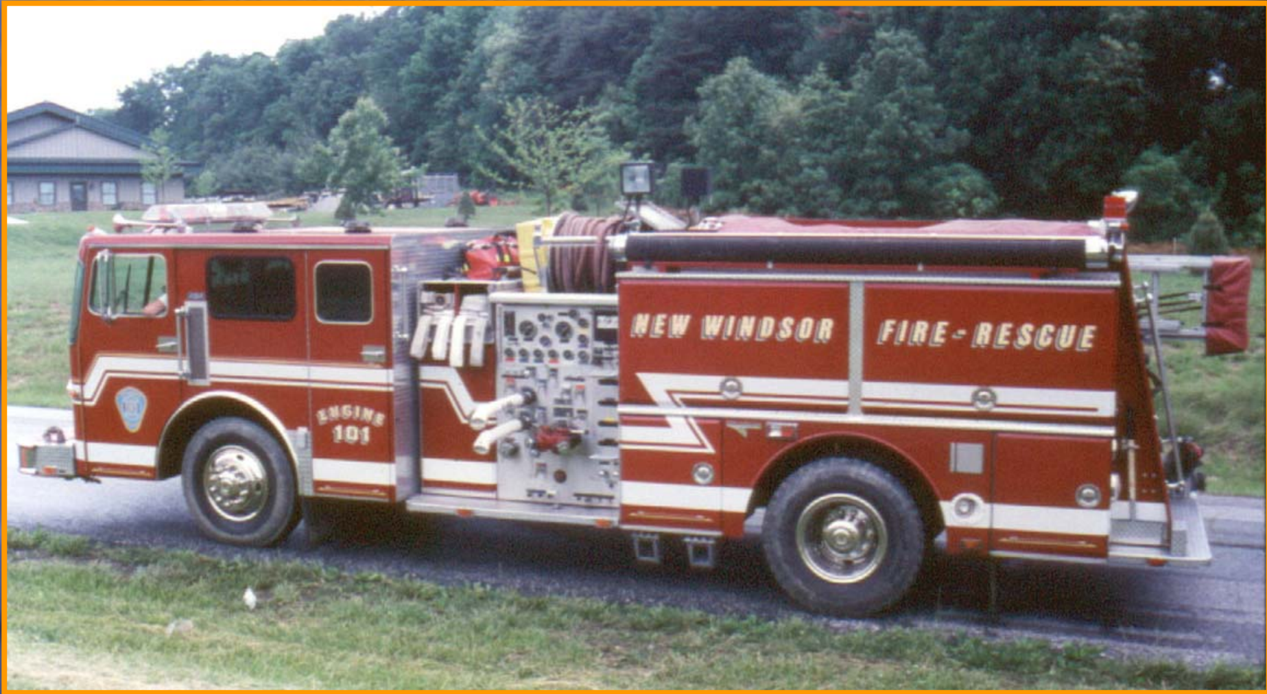
Figure 4. A pumper can be used for water transport even though its primary function is fire attack.