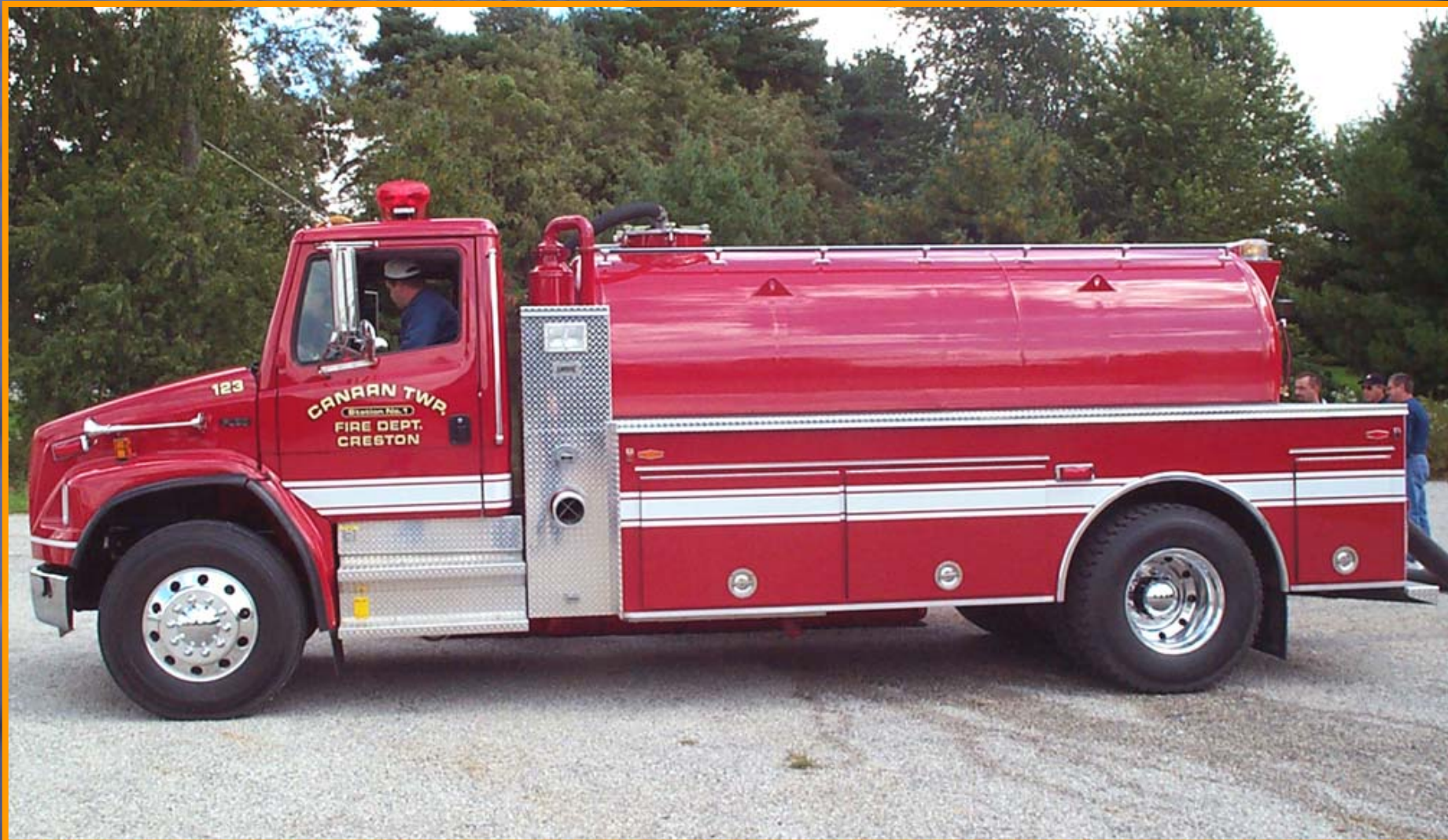
Figure 8. A tanker serves a single purpose — water transport.