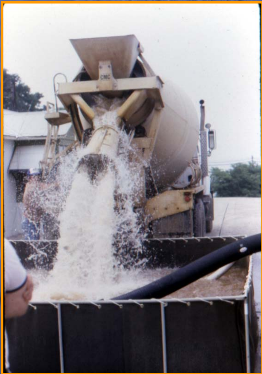
Figure 9D. A cement mixer can really haul and off-load water at a high rate. Here, the mixer off-loads its 2000 gallons in about 1 minute.

While maybe not practical for the average house fire, if and when a major haz-mat incident or a major fire occurs, it can be a tremendous asset.