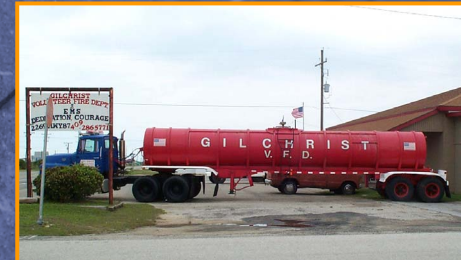
Figure 2. Although these vehicles vary greatly in design, they all share one thing in common: Departments designed them to haul water to fires to supply rural fire-attack operations. From the first time fire departments used tank vehicles to haul water to fires, these vehicles have been called tankers .