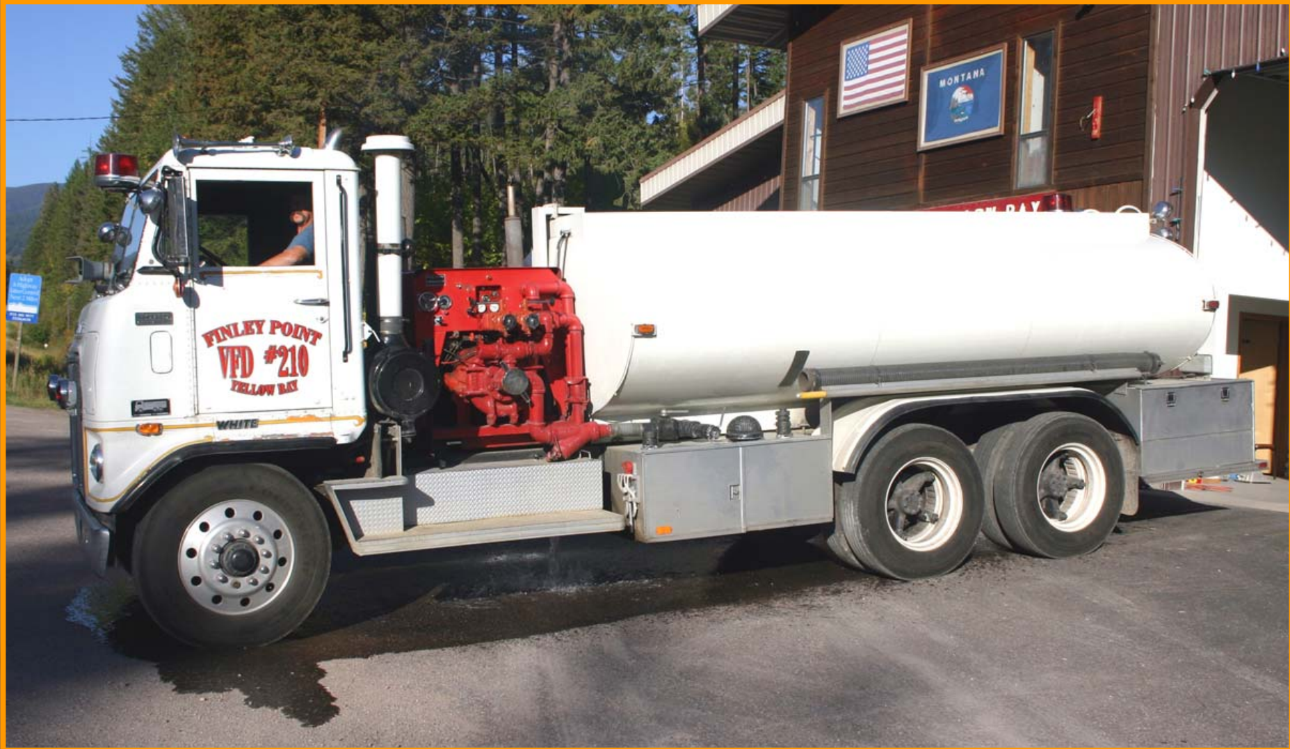
Figure 7. A Tanker with a pump has a primary purpose of water transport. The pump may provide limited fire attack capability.

Rural Fire Command — December 2005 — by Larry Davis